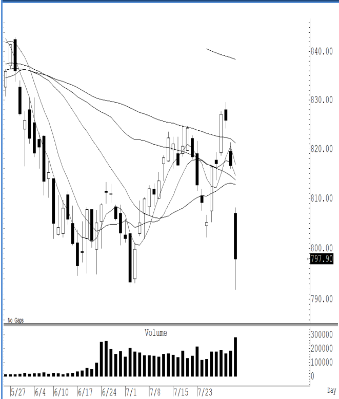
S50U24 (Close 797.90 Chg -18.70)

ปรับตัวลงต่ำกว่าเล็กน้อย ถือว่ายังดูสั้น สั้น ๆ ถ้ายังยังประคองตัวเหนือแนวรับแถว ๆ 792 จุดได้ แนะนำ trading ในกรอบ 792-812 จุด รับรู้กำไร ในกรณีที่ปิดต่ำกว่า 792 จุด แนะนำ ถือ short